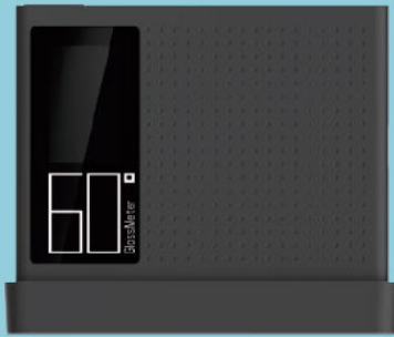
DG60 SE (Basic edition)